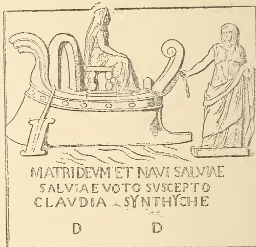
The Miracle of Claudia. Relief in the Capitoline Museum.

the ship becomes fast in the marshy shallow. Confusion seizes the multitude at the omen; the ship is as firm as an island. Claudia Quinta, of noble birth and as beautiful as she is noble, chaste but not untouched by slander, steps forth from the line of mothers, daughters, and Vestals, 23 dips her hands into the waters of the Tiber, sprinkles thrice her head, lifts thrice her palms to the heavens, kneels to the goddess, strong in the consciousness of her own purity, and with hair flowing loose, calls upon her for vindication from the charges of her enemies. Then rising, with only slight exertion she draws the sacred craft up the stream, while the multitude sends cries of joy to the skies.