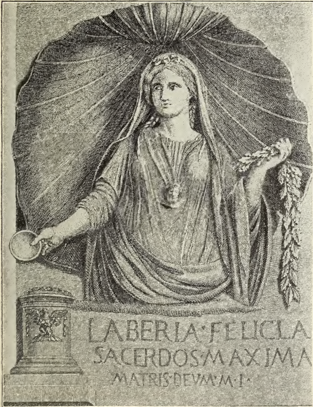
A PRIESTESS OF THE GREAT MOTHER.

From a Relief in the Vatican. (After Baumeister.)