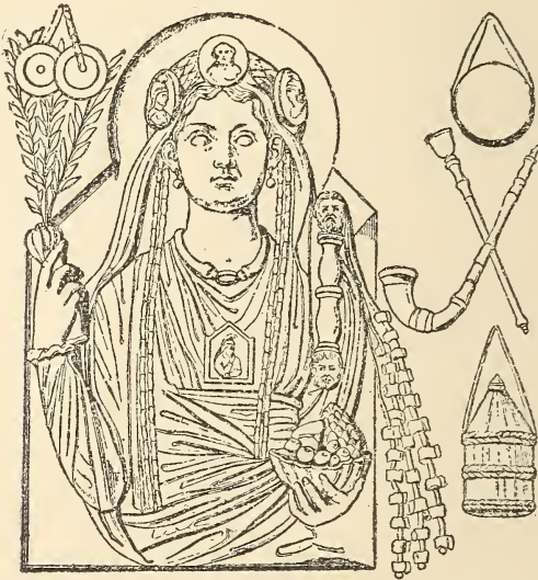
A Priest of the Great Mother. Relief in the Capitoline Museum, [After Baumeister,]

At the head of the ministry stood the Archigallus , or high priest. A relief of an Archigallus , found between Lanuvium and Genzano and now in the Capitoline Museum, shows